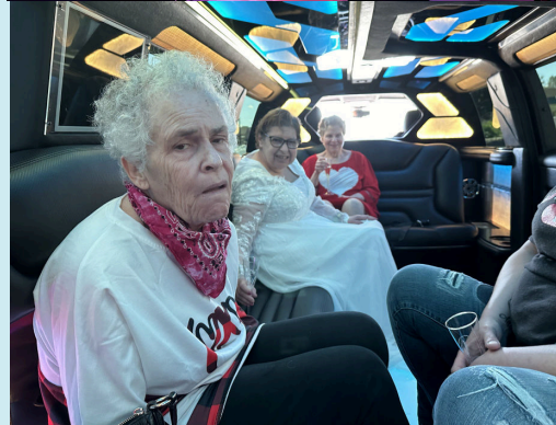
Our clients had a BLAST at our Laugh, Love and Brunch Ball.