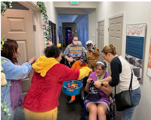
Members of the Development staff, dressed as Winne the Pooh characters, hand out candy to clients as they pass their office.