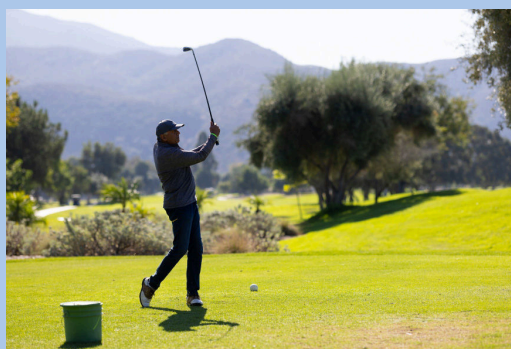
A golfer at the Golf Classic tees off on a gorgeous San Diego day.