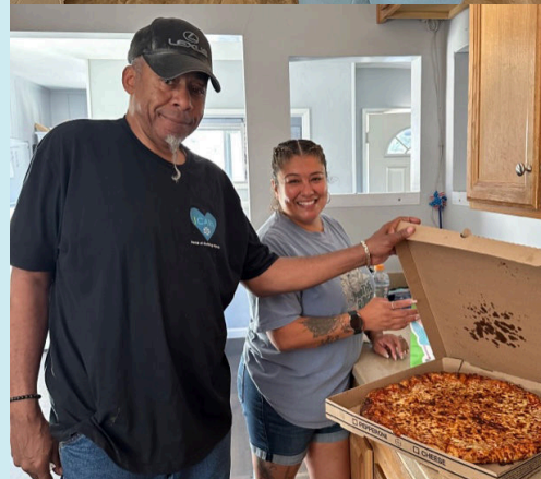
We were more than happy to surprise our DSP's in the homes with some delicious pizza and treats as a small token of our gratitude!

This year, we joyously marked DSP Recognition Week, a dedicated time to express our profound gratitude for our invaluable Direct Support Professionals (DSPs). These compassionate individuals play a crucial role in directly supporting those with intellectual and developmental disabilities. Originating in 2008 through the United States Congress, DSP Recognition Week aims to spotlight the indispensable contributions DSPs make to the lives of individuals with disabilities.