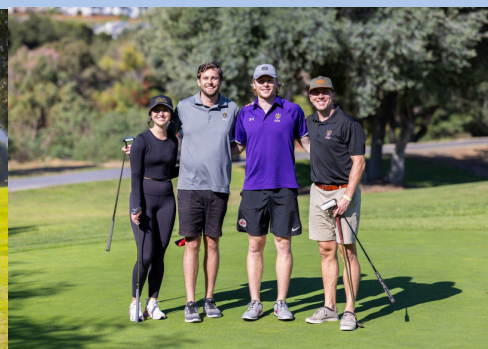
Staff and players of the Seals Lacrosse team had a great time playing to support our clients.