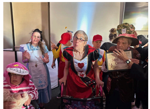
The clients from Bisby Lake home came themed as characters from Alice in Wonderland.