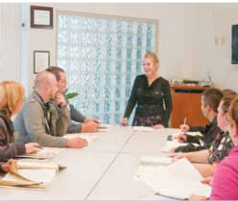
Thanks to the generosity of the Herbert and Marcella Beckett Fund, HGH was awarded an Organizational Success Grant for $3,500.