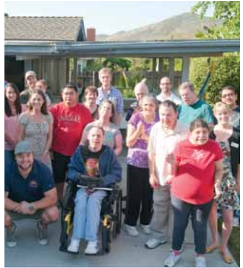
Corporate Partner Kineticom sponsors a Wii and Pizza Game Day for the Lakeshore and Windmill residents.