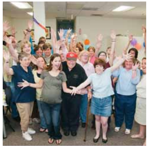
The Community Living Program gathers for Staff Appreciation Night.