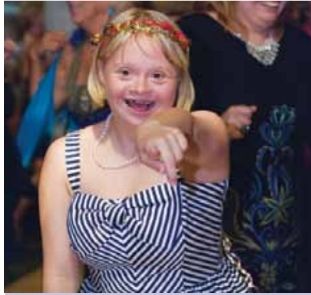
Guest Speaker and Glee superstar, Lauren Potter danced the night away at the Gala.