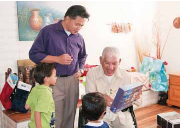
Qualcomm Legal Department sponsors the Ventana Home holiday party.