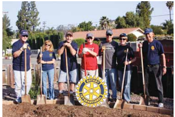
El Cajon Rotary Club transformed the front yard at the Penasco home on April 30 th "Rotarians at Work Day," a worldwide community service day.