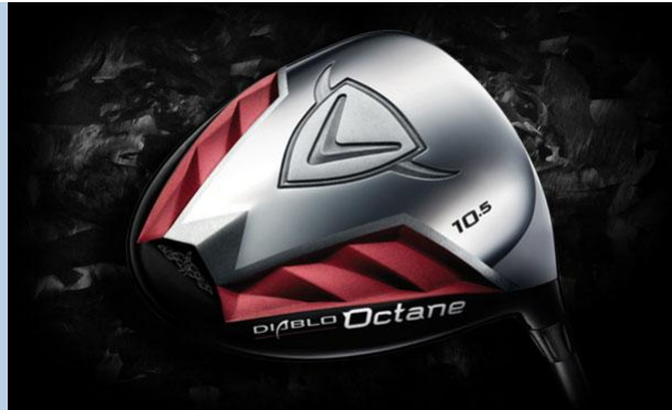
Callaway Diablo Octane Driver

Lighter, faster, stronger. It's what makes the all-new Diablo Octane Driver a revolution. Fueled by Forged Composite, a unique new material from Callaway that allows superior distribution of clubhead mass, compared with all-titanium drivers. The result? A lighter clubhead that retains an extremely high MOI. The Diablo Octane Driver powers drives beyond those of its all-titanium predecessor, the Diablo Edge Driver, by an average distance of 8 extra yards. Experience the most powerful driver ever imagined - the Diablo Octane Driver with Forged Composite.