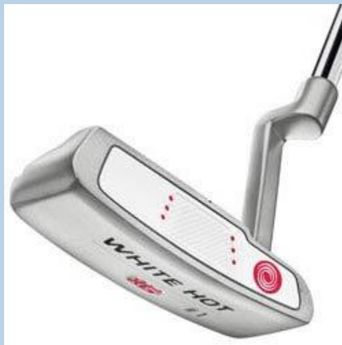
Callaway XG 35" Putter

Lighter, faster, stronger. It's what makes the all-new Diablo Octane Driver a revolution. Fueled by Forged Composite, a unique new material from Callaway that allows superior distribution of clubhead mass, compared with all-titanium drivers. The result? A lighter clubhead that retains an extremely high MOI. The Diablo Octane Driver powers drives beyond those of its all-titanium predecessor, the Diablo Edge Driver, by an average distance of 8 extra yards. Experience the most powerful driver ever imagined - the Diablo Octane Driver with Forged Composite.