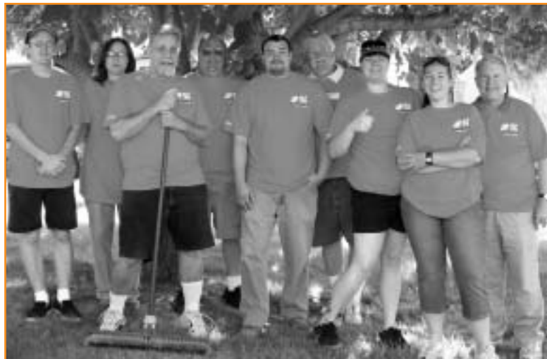
Members of the Home Depot of El Cajon - Team Depot volunteer group.