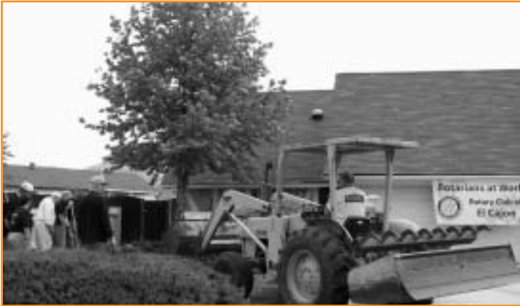
Rotarians use heavy equipment to remove Yucca from the front yard at Anja House.

Community and employee-based organizations have been active partners with Home of Guiding Hands (HGH) throughout its 40-year history, contributing time, labor, materials and items to assist the organization in its mission.